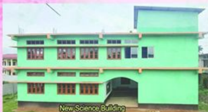
New Science Building