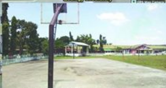
Basketball Court at West Goalpara College