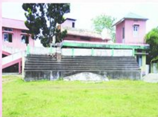
Gallery at West Goalpara College