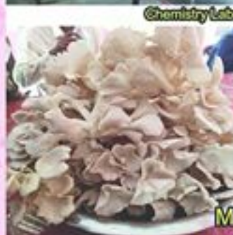
Mushroom Cultivation by Botany Deptt.